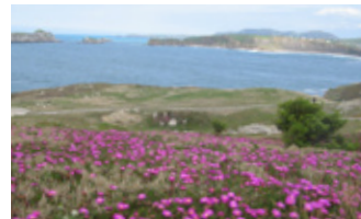
Cantabrian coast near Santander