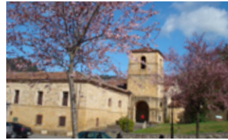
Parador at Cangas de Onis