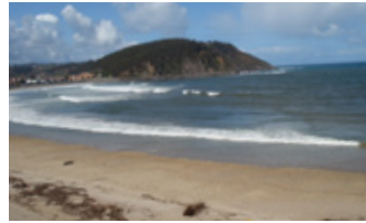
Santa Marina beach Ribadesella