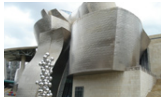
Guggenheim Museum Bilbao