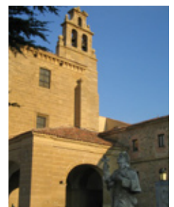
Parador at Sto Domingo

OR 29 September 11 nights combining the relaxing days in Asturias with city visits and wine tasting in La Rioja. Fly to Santander on 29 September and back from Bilbao on 10 October €2545 reduced to €2480 to give a complimentary lunch at Marques de Caceres to those staying for 11 nights + flights Single supplement €50 per night