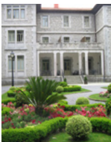
Parador at Limpias

€1250 per person sharing + flights Single supplement €50 per night